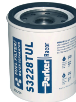
Marine Replacement Filter Elements – Racor Marine Spin-on Series