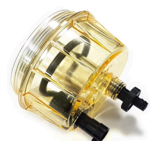
Fuel Spin-on Bowl and Water Sensor Kits - Racor