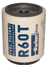
Replacement Filter Elements – Racor Spin-on Series