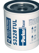
Marine Replacement Filter Elements – Racor Marine Spin-on Series