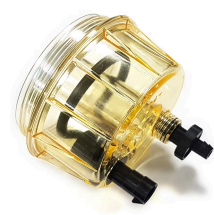
Fuel Spin-on Bowl and Water Sensor Kits - Racor