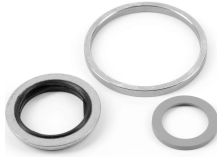
Accessories for Ermeto hydraulic DIN fittings