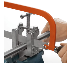
Cutting and bending tools