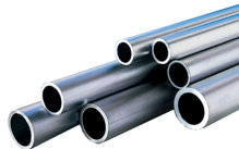
Seamless EO tubes and tube bends