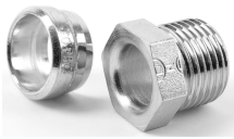
Ermeto DIN fitting components for high pressure hydraulic tube fittings