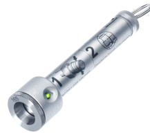
Assembly tools for EO assembly machines