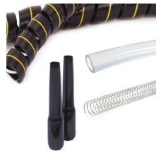
Hose Guards for Parflex Hoses