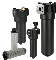
High Pressure Inline Hydraulic Oil Filter - iProtect® EPF Series