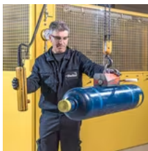
Parker Certified Accumulator Service Centers