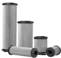
Medium Pressure Hydraulic Oil Filter Replacement Elements - iProtect® GMF Series