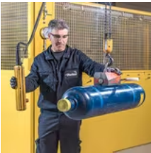
Parker Certified Accumulator Service Centers