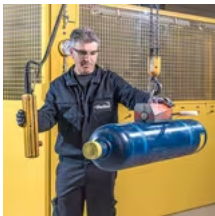
Parker Certified Accumulator Service Centers