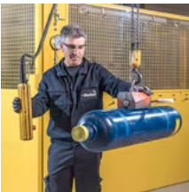
Parker Certified Accumulator Service Centers