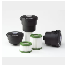
Hydraulic Reservoir Breather / Air Filter - EAB Series