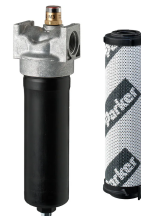
Medium Pressure Inline Hydraulic Oil Filter – iProtect® GMF Series