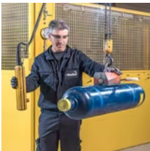
Parker Certified Accumulator Service Centers