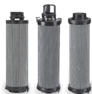
High Pressure Hydraulic Oil Filter Replacement Elements – iProtect® EPF Series