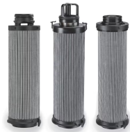
High Pressure Hydraulic Oil Filter Replacement Elements – iProtect® EPF Series