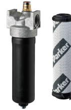
Medium Pressure Inline Hydraulic Oil Filter – iProtect® GMF Series