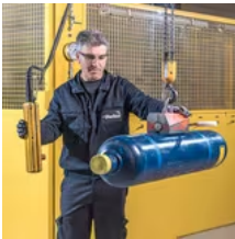
Parker Certified Accumulator Service Centers