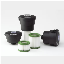
Hydraulic Reservoir Breather / Air Filter - EAB Series