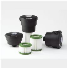
Hydraulic Reservoir Breather / Air Filter - EAB Series