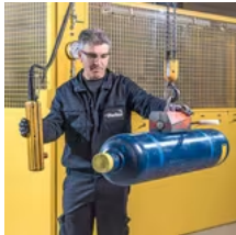
Parker Certified Accumulator Service Centers