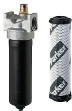
Medium Pressure Inline Hydraulic Oil Filter - iProtect® GMF Series