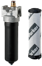
Medium Pressure Inline Hydraulic Oil Filter - iProtect® GMF Series