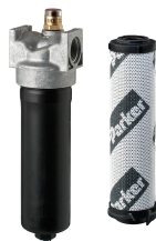
Medium Pressure Inline Hydraulic Oil Filter - iProtect® GMF Series