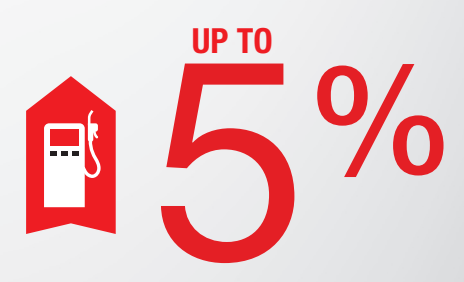
Improve fuel economy up to 5% due to real-time indication of your filters and oil health.

Reduce filter changes by up to 50% per year for fuel and air.