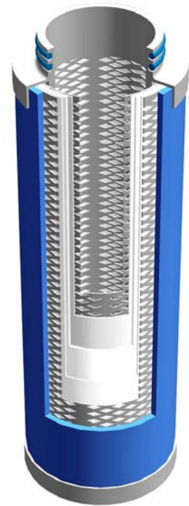
Cross section of the Ultrair depth filter

By utilising various filtration mechanisms such as retention by direct impact, sieve effect and diffusion effect, liquid aerosols and solid particles down to the size of 0.01 µm are being retained in the filter.