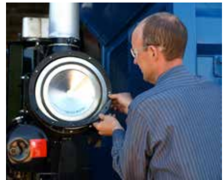
When servicing the EBB, make sure to replace the cover gasket when changing filters.